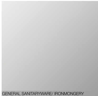
GENERAL SANITARYWARE/ IRONMONGERY