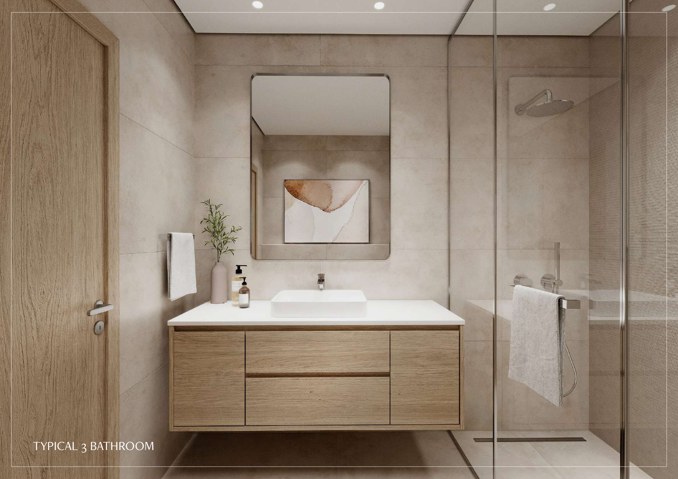
TYPICAL 3 BATHROOM