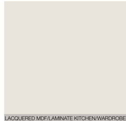
LACQUERED MDF/LAMINATE KITCHEN/WARDROBE