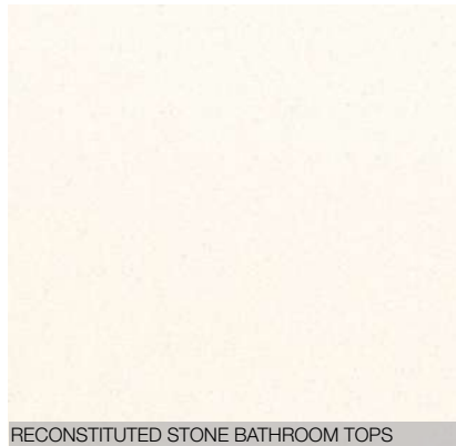
RECONSTITUTED STONE BATHROOM TOPS