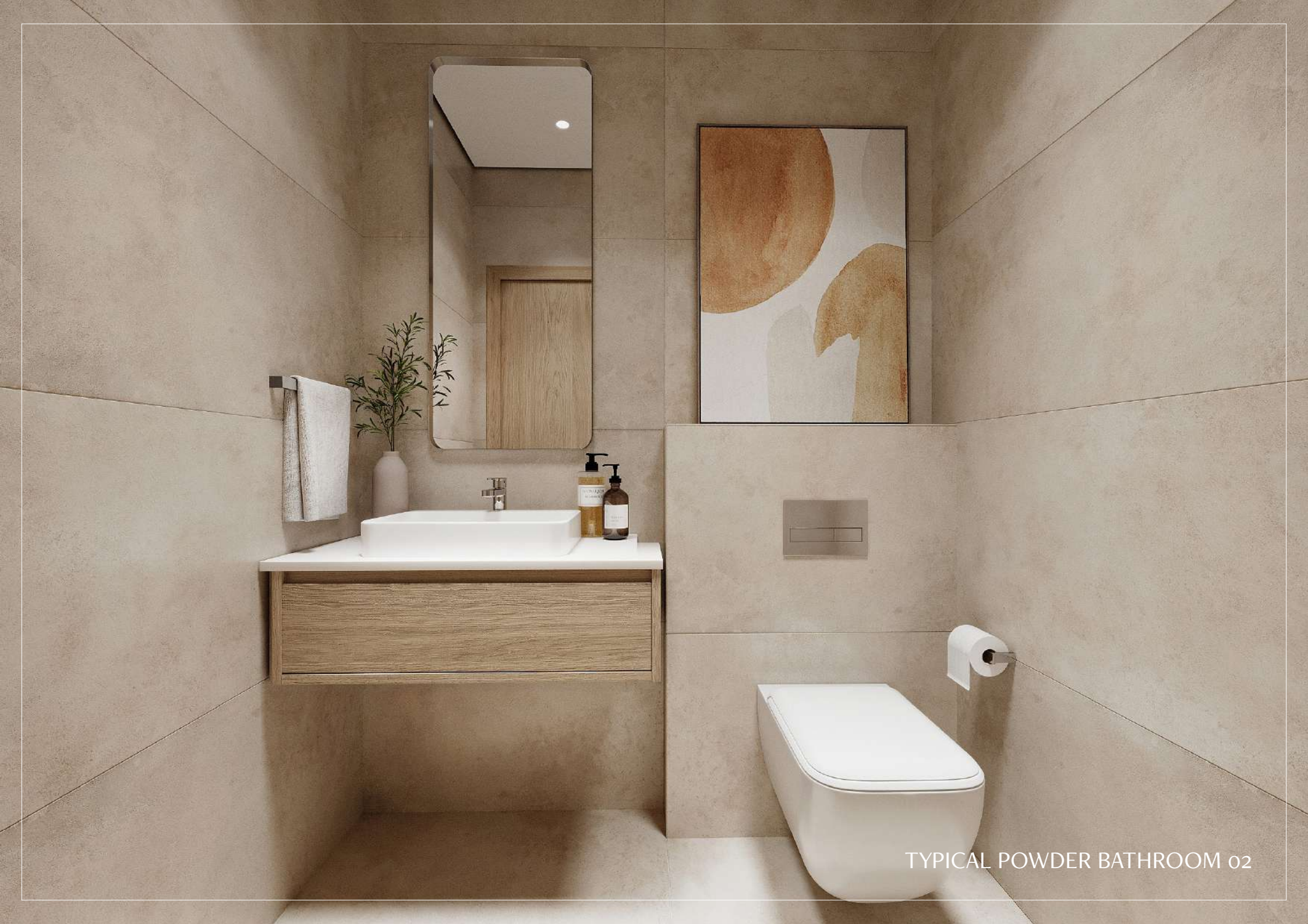
TYPICAL POWDER BATHROOM 02