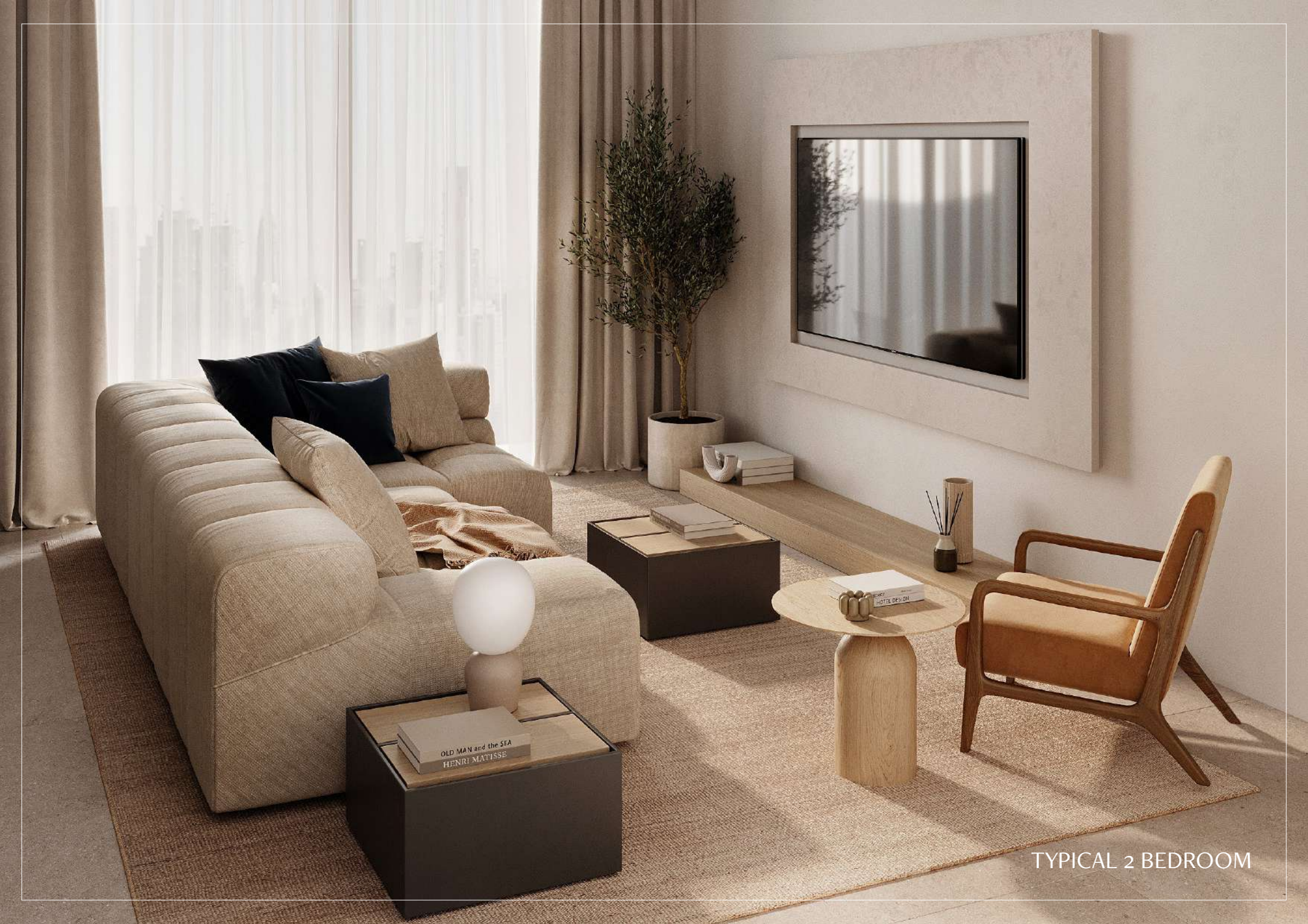
TYPICAL 2 BEDROOM