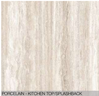
PORCELAIN - KITCHEN TOP/SPLASHBACK