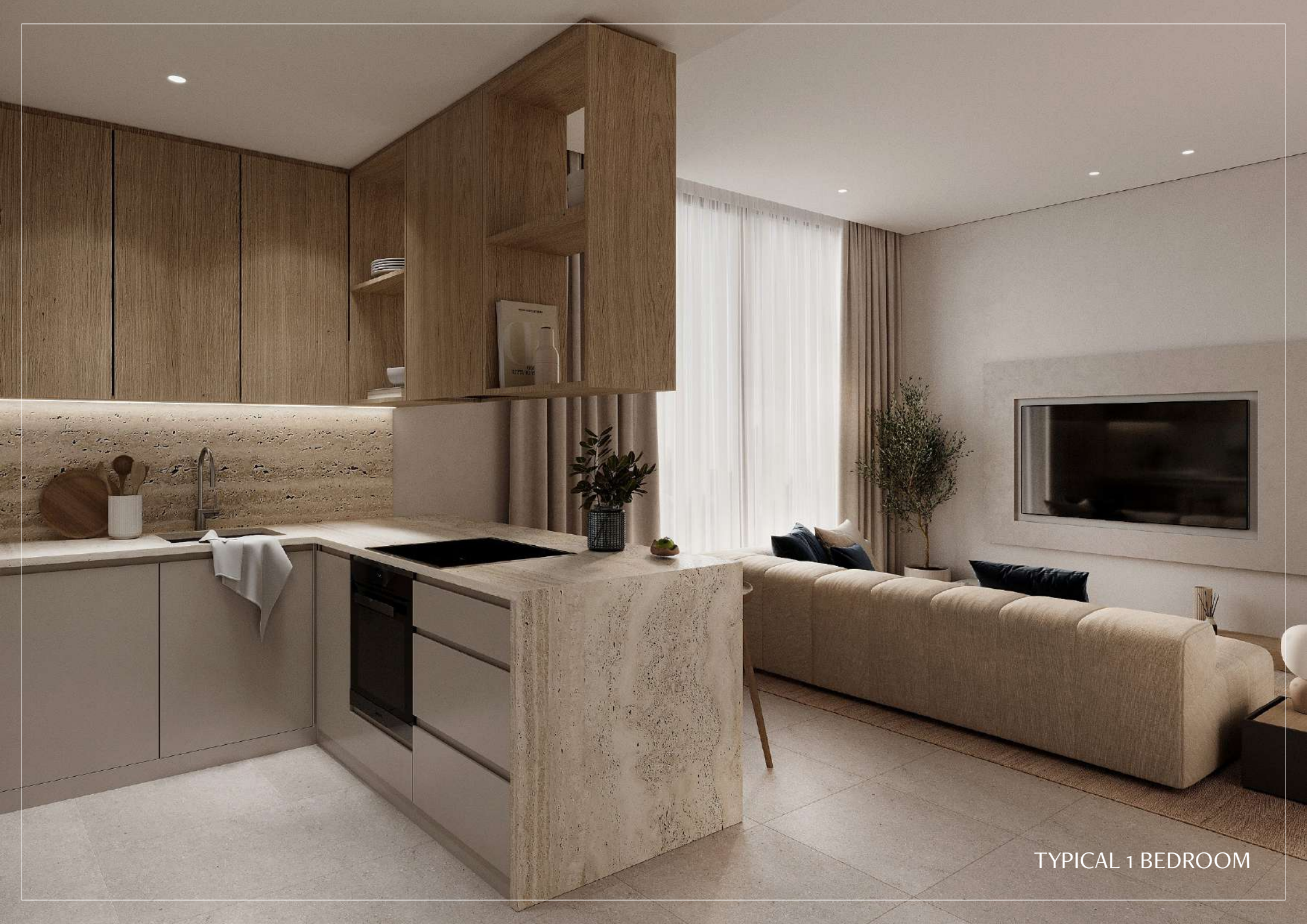
TYPICAL 1 BEDROOM