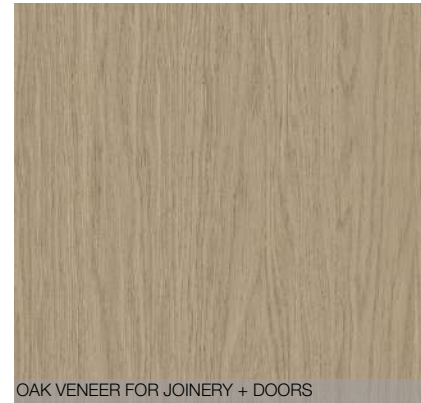
OAK VENEER FOR JOINERY + DOORS