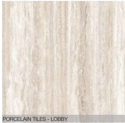
PORCELAIN TILES - LOBBY