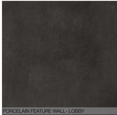
PORCELAIN FEATURE WALL - LOBBY