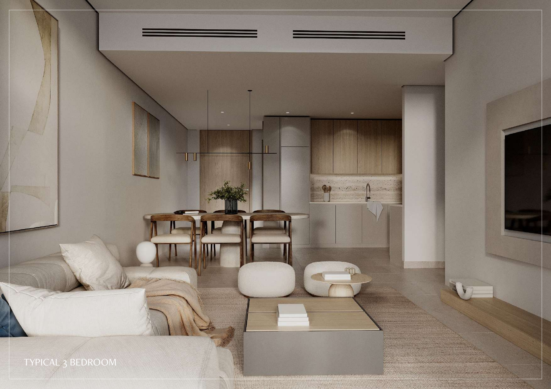
TYPICAL 3 BEDROOM