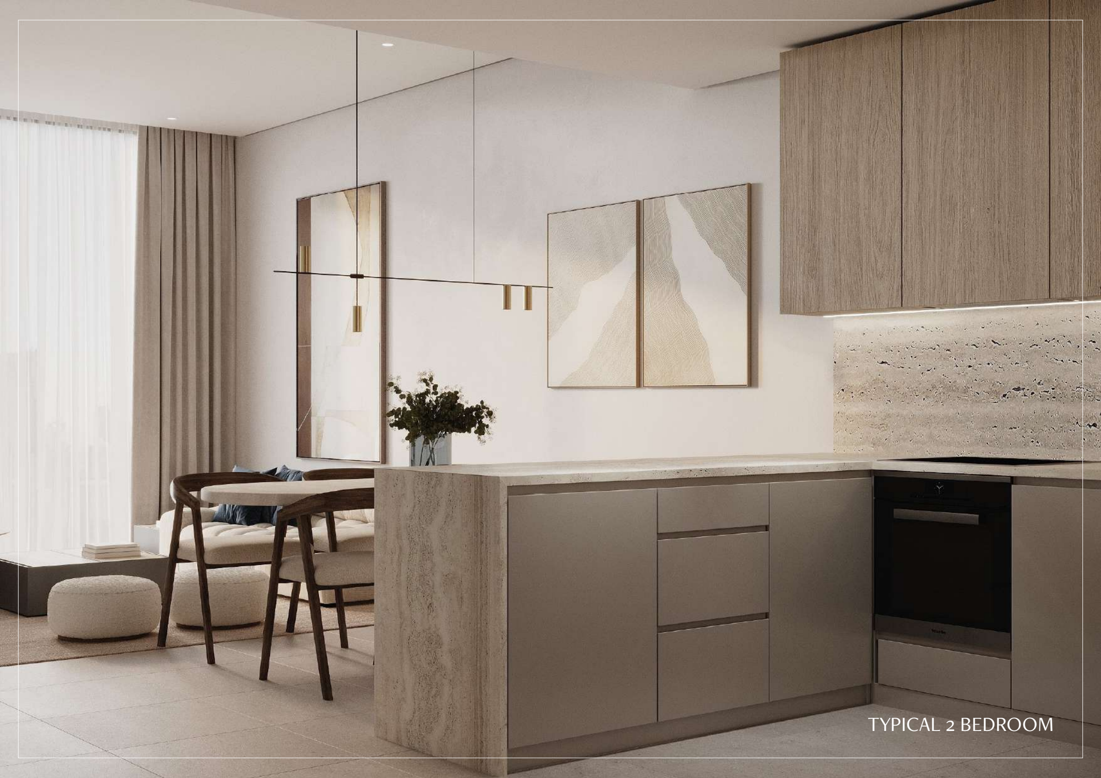
TYPICAL 2 BEDROOM