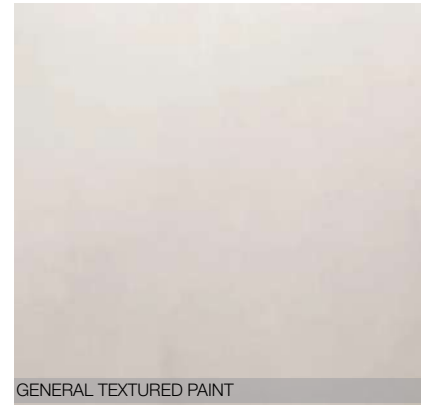
GENERAL TEXTURED PAINT