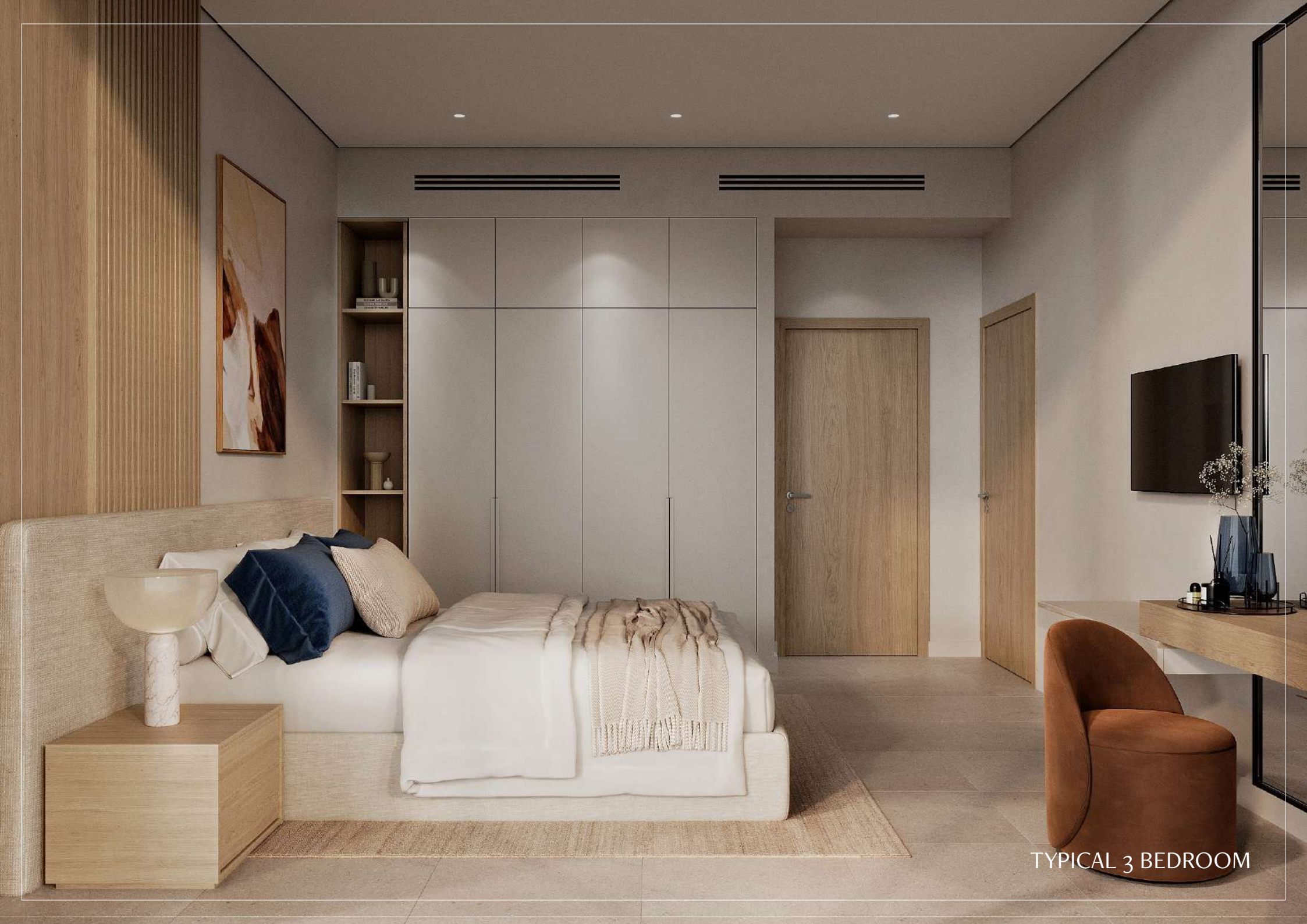
TYPICAL 3 BEDROOM