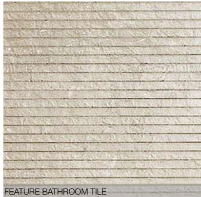
FEATURE BATHROOM TILE