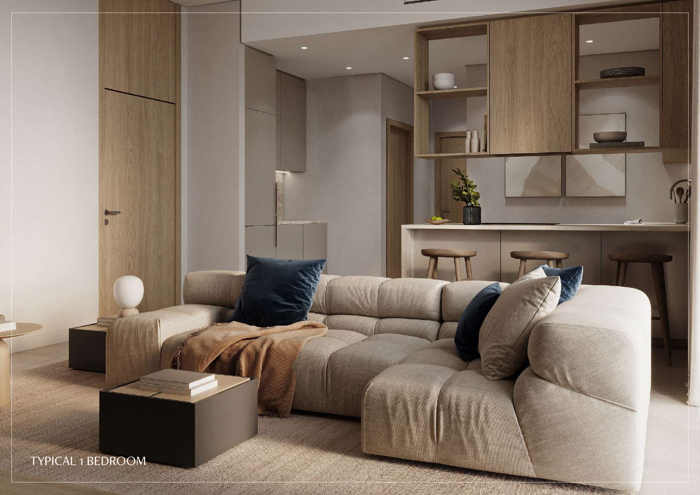
TYPICAL 1 BEDROOM