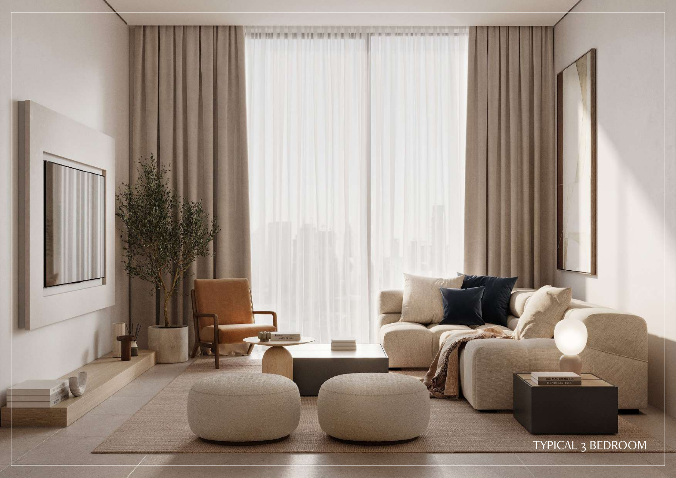
TYPICAL 3 BEDROOM