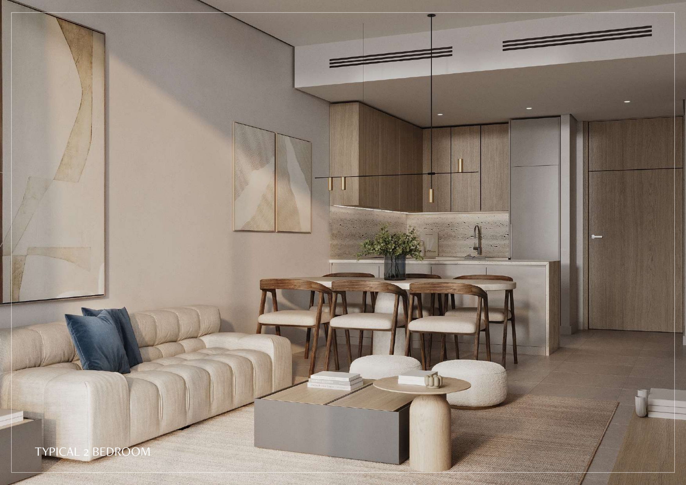
TYPICAL 2 BEDROOM