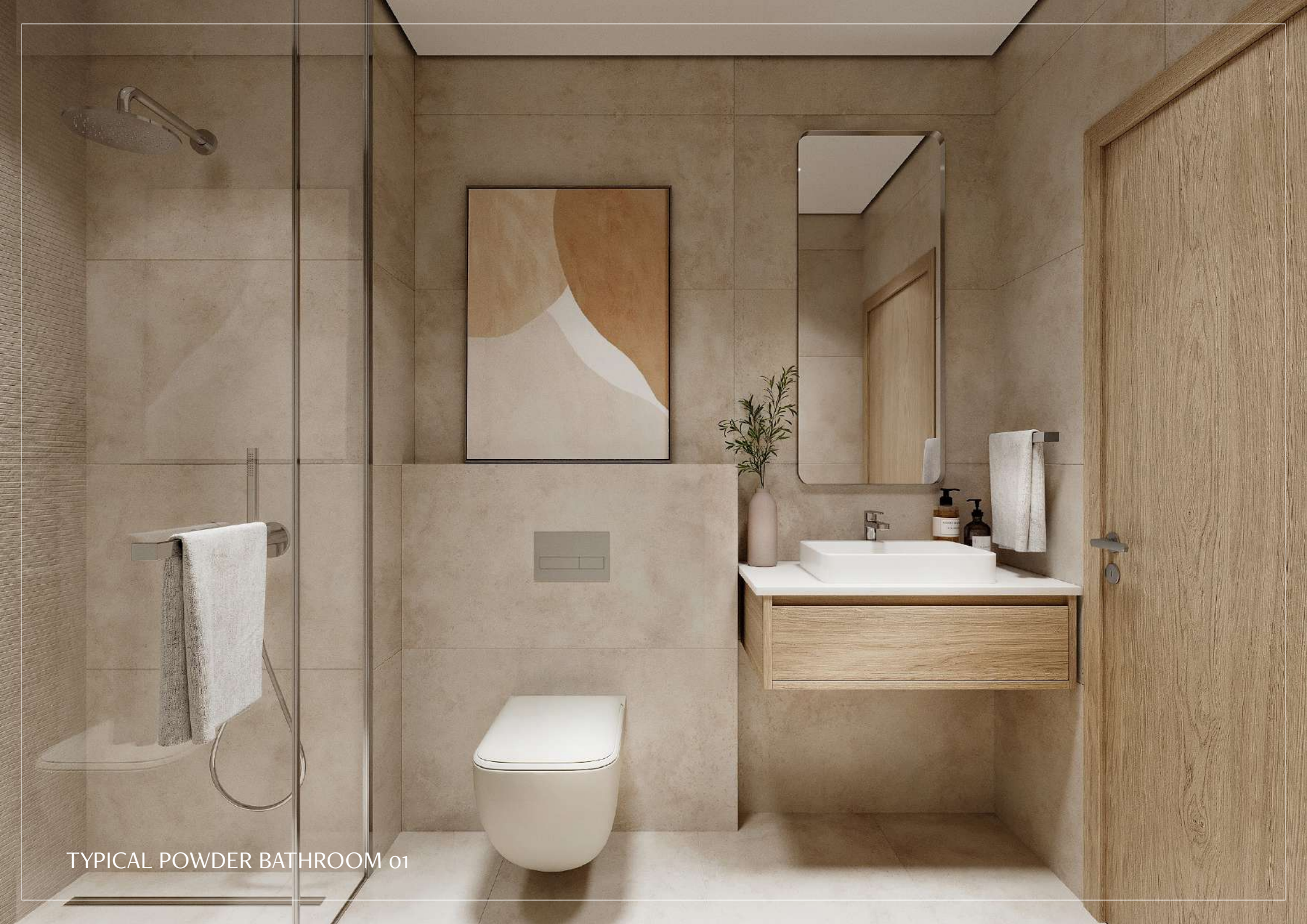
TYPICAL POWDER BATHROOM 01