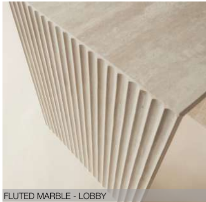
FLUTED MARBLE - LOBBY