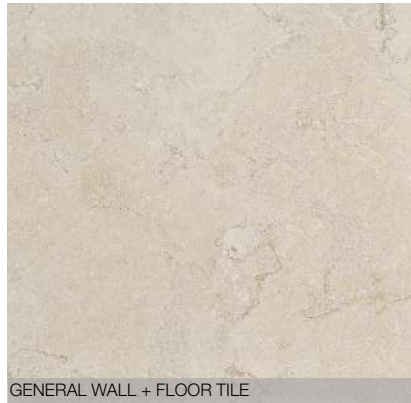
GENERAL WALL + FLOOR TILE