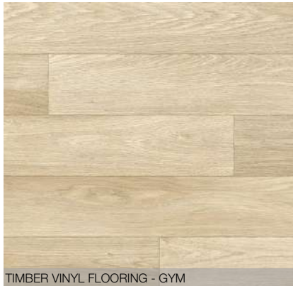
TIMBER VINYL FLOORING - GYM