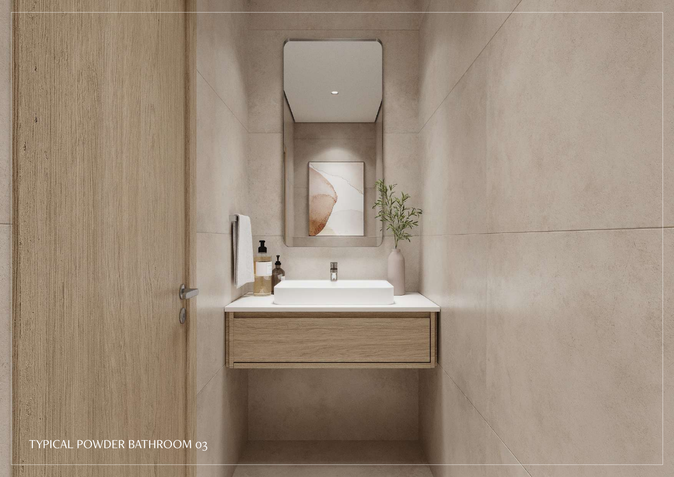
TYPICAL POWDER BATHROOM 03